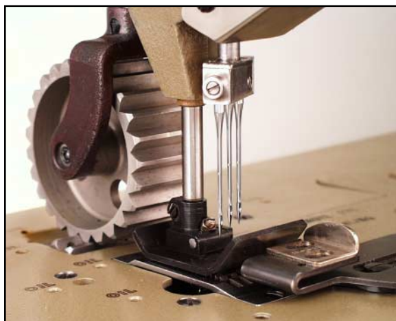
Close-up of the 38200C24 sewing area, showing puller and cloth guides. The 24 gauge needle spacing is equal to 3/8" (9.5mm).