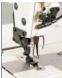
Needle thread clamp mechanism and sliding presser foot