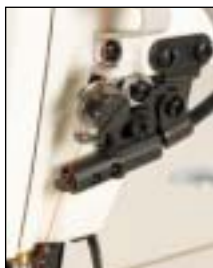
Needle thread draw-out mechanism

The machine comes with a silicon oil lubricating unit, thread spreading mechanism and thread trimming mechanism which trims the thread without fail, thereby consistently ensuring beautifully-finished seams for light- to medium-weight materials. The appearance of the machine is restyled, and it is now colored in a refreshing urban white.