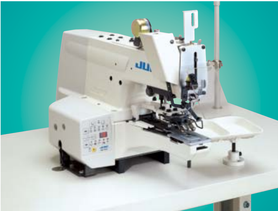
MB-1800B (Table stand is optionally available.)

A new button sewing machine that supports many different button sewing specifications independently.