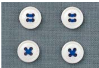
with cross-over stitches without cross-over stitches