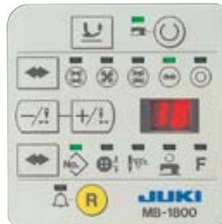
● Easy-to-use operation panel

Shorter lengths of thread remain after thread trimming