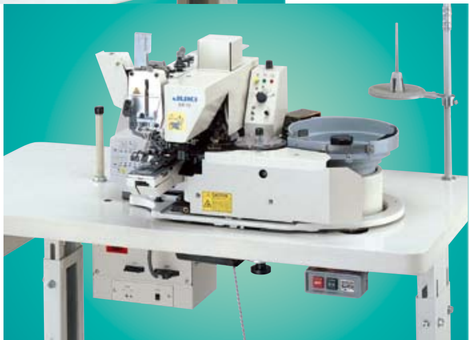
MB-1800A/BR10 (The stand leg is optionally available.)