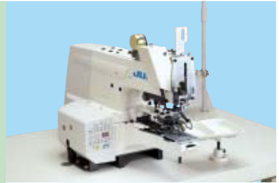
MB-1800B (Table stand is optionally available.)

It comes with direct-drive electronic feed driven by a compact AC servomotor to guarantee excellent seam quality and dramatically improve flexibility and maintainability.