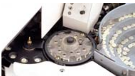
● Horizontal, forced feed mechanism