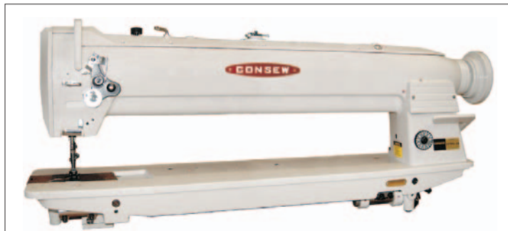
Model 254RBL-25 HEAVY DUTY, SINGLE NEEDLE DROP FEED, NEEDLE FEED LOCKSTITCH MACHINE