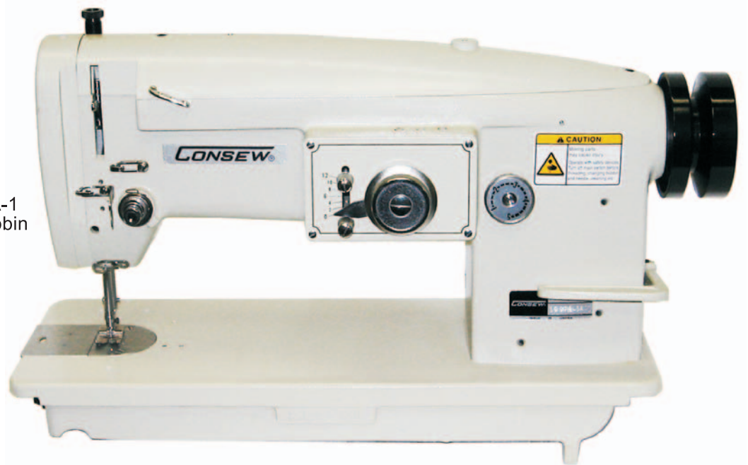
199RB-1A-1 Large Bobbin

COMBINATION ZIG-ZAG AND STRAIGHT STITCHER