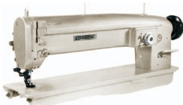
146RBL Up to 30" Long Arm in 1A, 2A or 3A configuration (special order)

SINGLE NEEDLE DROP FEED WALKING FOOT ZIG-ZAG LOCKSTITCH MACHINE